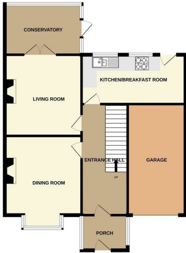
GROUND FLOOR 838 sq.ft. (77.9 sq.m.) approx.